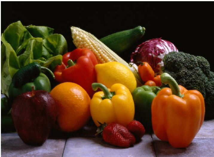
Fresh produce . . .

Our scope of work is to recycle the water effluent from several lines of pallet washing. The clean sanitized pallets are used to transport produce (fresh fruits and vegetables) from farm distribution points to supermarkets. The recycling water system is designed to treat city water used in the washing process collected in a sump pit, with a moderately high content of organic & inorganic debris and detergent and common hardness of soluble ion sources.